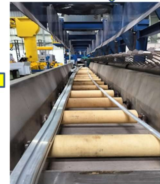
SPRAY NOZZLE TABLE