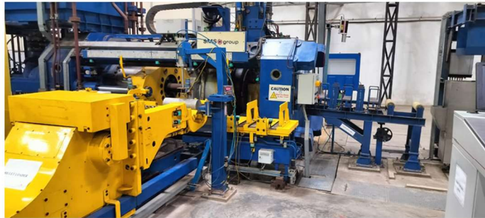
EXTUSION PRESS 14 MN